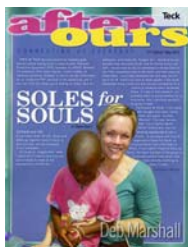
Cover of latest After Ours issue.

This issue, we thought it would be an interesting idea to fill our readers in on the day-to-day operations in the office. Since the beginning of 2013, the archives has had nearly 100 research enquiries, with subjects ranging anywhere from genealogy, newspaper research, and photograph searches. For enquiries that require considerable staff time, particularly those submitted by Teck, an hourly rate is charged, which provides additional revenue for the Society.