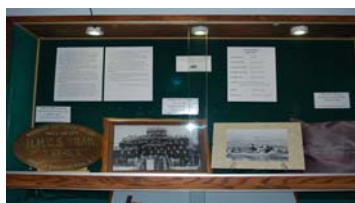
The HMCS Trail exhibit on display at the Royal Canadian Legion, Trail Branch

In April, the Society was approached by the City to consider developing a display in commemoration of the Battle of the Atlantic, in which the HMCS Trail corvette participated. The Royal Canadian Legion Trail Branch kindly permitted the Society to utilize exhibit space in their facility to display some artifacts from the ship, as well as some information on its role in the war.